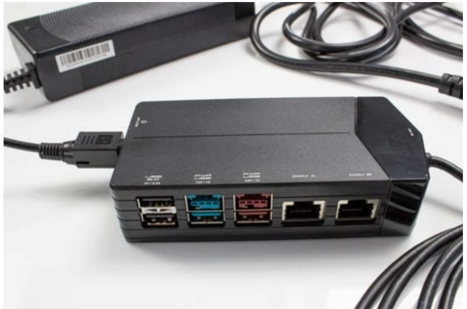
External IO-Hub (optional)