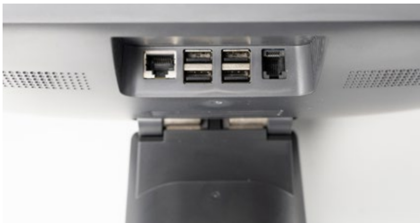
Interfaces (display bottom)