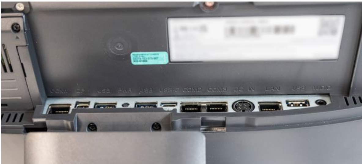
Interfaces (display back)