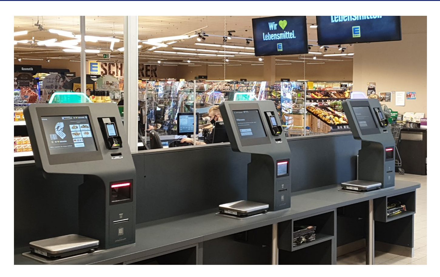
Since 2020: Self-checkout with the POLYTOUCH® PORTAL